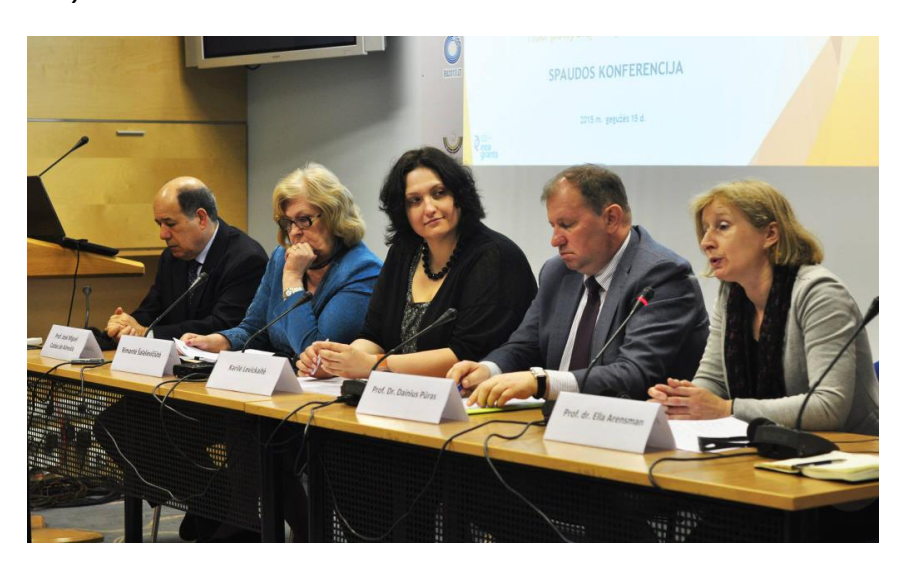
The press-conference at the Parliament of the Republic of Lithuania in May 2015.