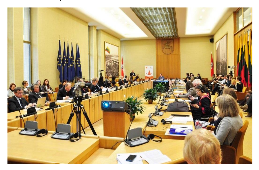
The conference at the Parliament of the Republic of Lithuania in May 2015.

mental health, develop community-based services, transform primary mental health care system and implement suicide prevention. The financial calculations were also presented painting a clear picture that significant changes in the system could be achieved by effective allocation of funds. This plan was presented to the public and decision-makers in May 2015, during a conference held in the Parliament of the Republic of Lithuania. The response was an intense public discussion and high public interest, which was not expected and not yet seen around the topic as sensitive as mental health before.